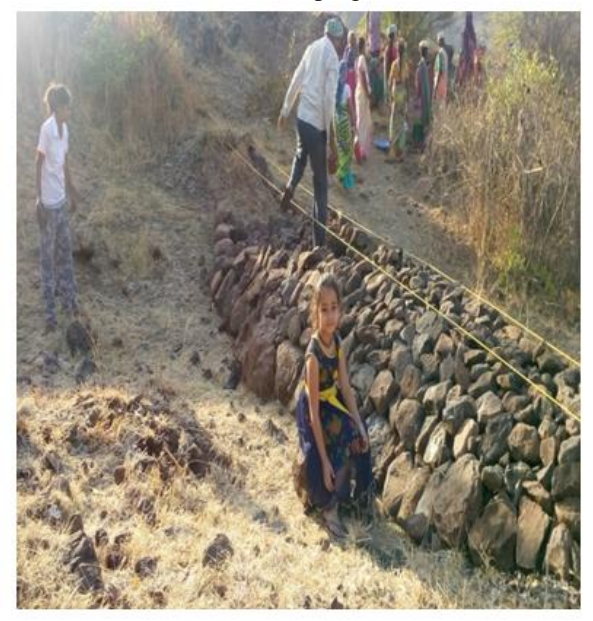
after work done